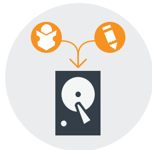
Traditional storage protocols only offer Read/Write functionality.

.... that can be used across the internet. The S3 API offers so much more capability for managing your data over traditional storage protocols such as Fibre Channel (FB), iSCSI, CIFS or NFS.