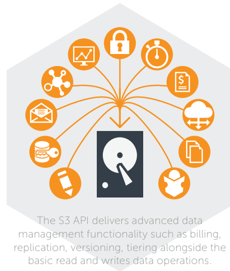
The S3 API delivers advanced data management functionality such as billing, replication, versioning, tiering alongside the basic read and writes data operations.

Cloudian HyperStore is the only platform on the market that offers 100% compatibility with AWS S3 implementation, providing support for over 4,000 applications.